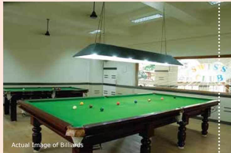
Actual Image of Billiards