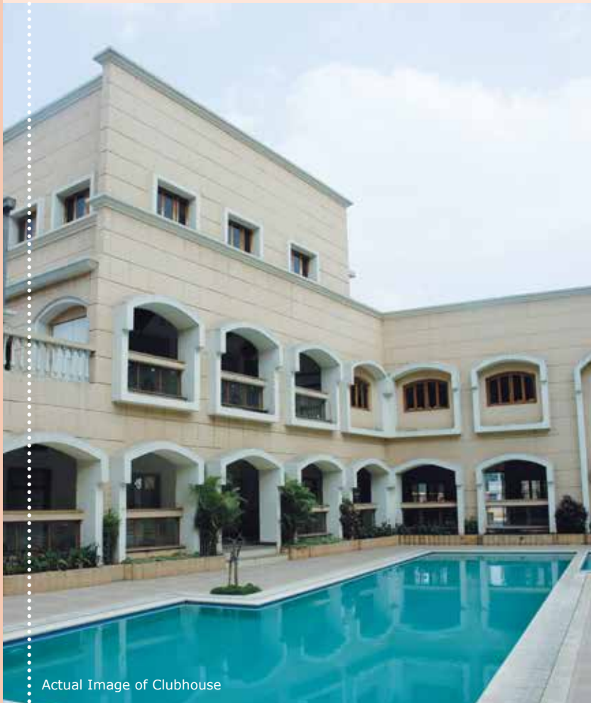
Actual Image of Clubhouse

Bliss offers its residents the entire gamut of luxury amenities with each offering designed to infuse charm and serenity into daily life. Right from its beautiful grand entrance to the invigorating sports arenas, everything here will inspire you to shrug off all your troubles and immerse yourself in the blissful experiences that surround you.