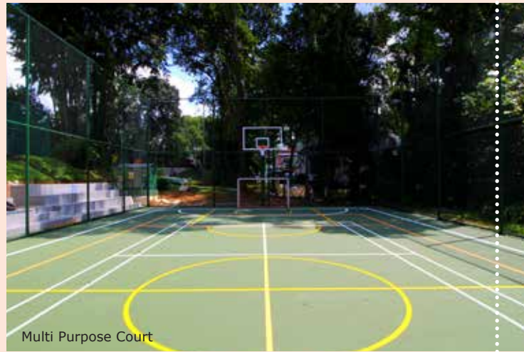
Multi Purpose Court